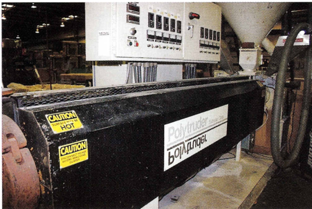
Custom plastic profiles available