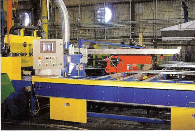
Custom aluminum extrusions, anodizing, painting and CNC