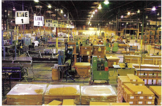
Capacity to extrude over 10 million pounds annually